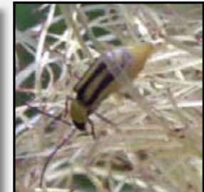
Adult Western Corn Rootworm