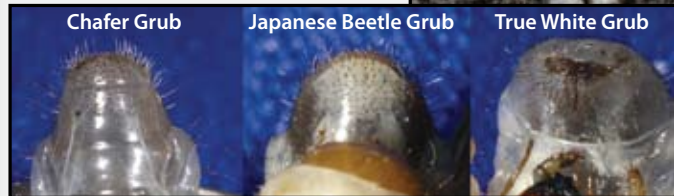
Chafer Grub Japanese Beetle Grub True White Grub