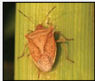
Brown Stink Bug