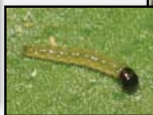
European Corn Borer 1 st generation