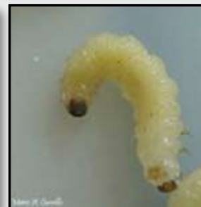
Corn Rootworm Larva