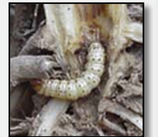
Southwestern Corn Borer Larva