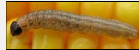
European Corn Borer 2 nd generation