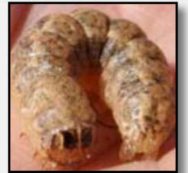
Western Bean Cutworm