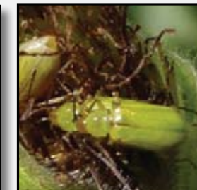
Adult Northern Corn Rootworm