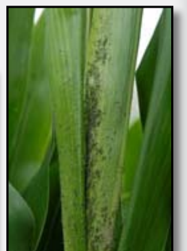
Corn Leaf Aphids