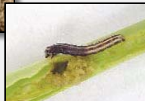
Common Stalk Borer