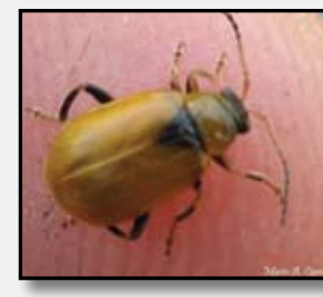
Bean Leaf Beetle (unspotted color phase)