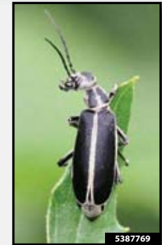
Margined Blister Beetle (adult)