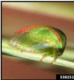
Three Cornered Alfalfa Hopper (spotted red phase)