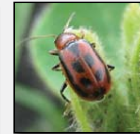
Bean Leaf Beetle