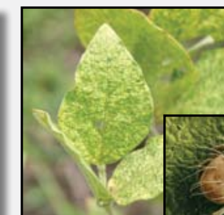
Two-Spotted Spider Mite