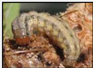
Soybean Podworm (bollworm)