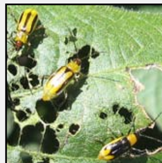
Corn Rootworm (adult)