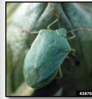
Southern Green Stink Bug