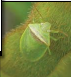
Redbanded Stink Bug