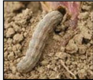
Black Cutworm larva