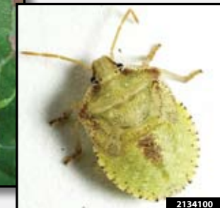
Brown Stink Bug