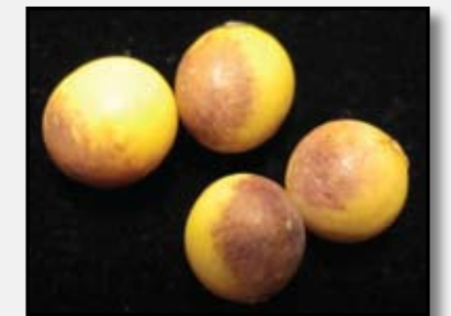
Purple Stain (via Cercospora)