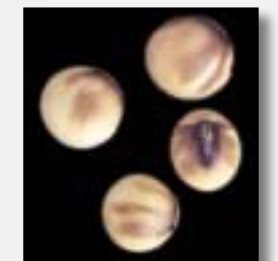
Bleeding Hilum (via Soybean Mosaic Virus)