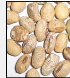
Phomopsis infected seeds