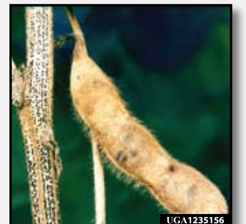
Pod and Stem Rot