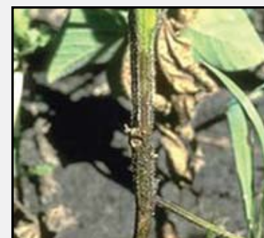
Phytophthora Root Rot