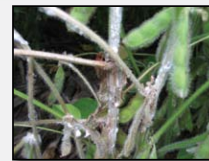
Sclerotinia Stem Rot (white mold)