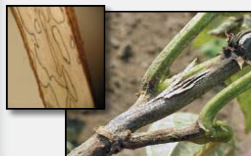
Soybean Charcoal Rot