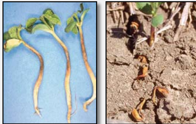
Pythium infected seedlings