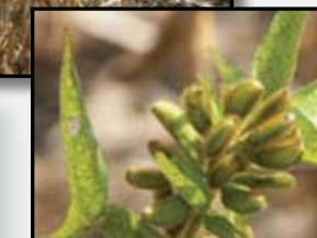
Bud Blight (via Tobacco Ringspot Virus)