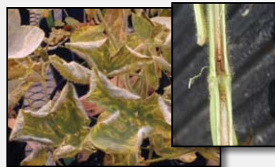
Brown Stem Rot