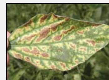
Sudden Death Syndrome